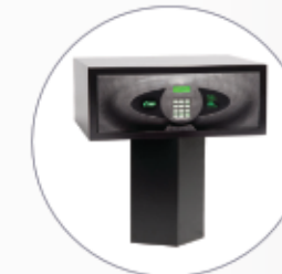
Color Matched Pedestals