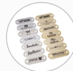
Custom Logo Plates (Available on Select Models)